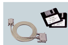
RS-R8500 REMOTE CONTROL SOFTWARE Remotely controls the IC-R8500 from a PC.