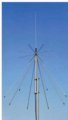
AH-7000 SUPER WIDEBAND OMNIDIRECTIONAL ANTENNA Frequency coverage: 25–1300 MHz

Available options may vary between countries.