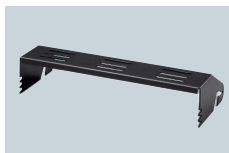
IC-MB12 MOBILE MOUNTING BRACKET Receiver mounting bracket for mobile operation.