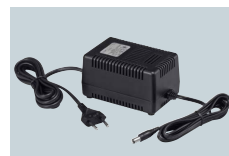
AD-55/A/V AC ADAPTER Allows you to power the receiver via domestic AC.