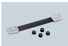
MB-23 CARRYING HANDLE For easy portable operation.