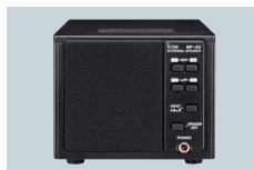
SP-23 EXTERNAL SPEAKER 4 audio filters; headphone jack. Input impedance: 8Ω. Max. input power: 5W (Not available for EU countries)