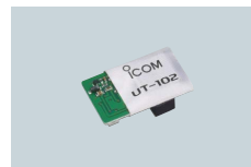
UT-102 VOICE SYNTHESIZER UNIT Provides audible confirmation of an accessed band's frequency.