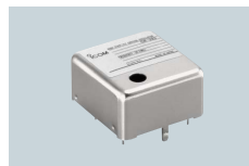
CR-293 HIGH STABILITY CRYSTAL UNIT Frequency stability: ±0.5 ppm at 0°C to +60°C