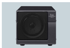
SP-21 EXTERNAL SPEAKER Input impedance: 8 Ω. Max. input power: 5 W