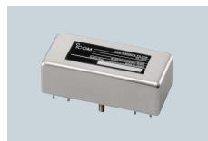
FL-52A CW NARROW FILTER Center freq.: 455 kHz. Bandwidth: 500 Hz/–6 dB