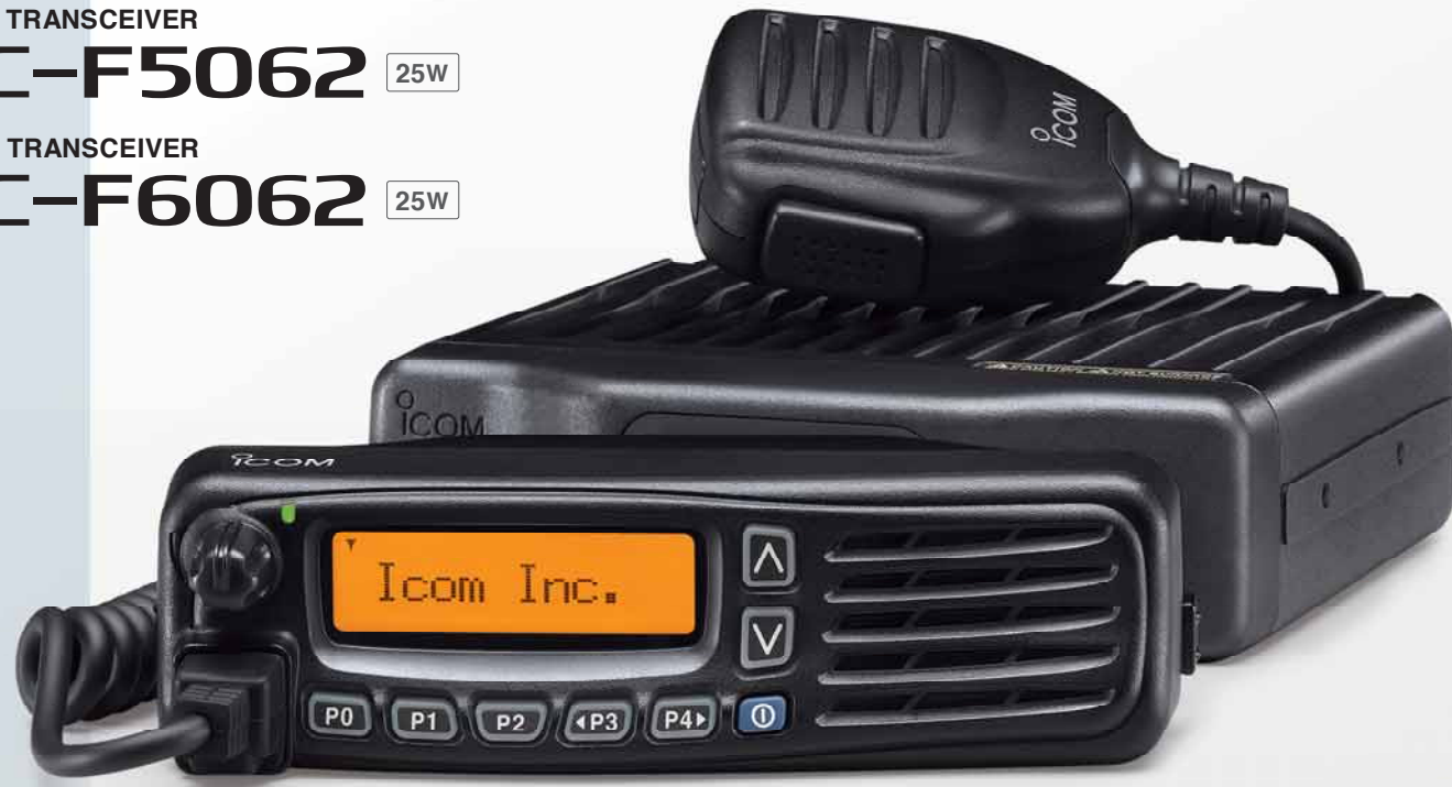
The above photo includes optional separation kit, RMK-3, and separation cable, OPC-609.