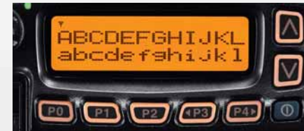
Two line setting display example.

With a high contrast dot matrix display, upper and lower case characters can be easily distinguished. You can change the display setting to show one line and 12 characters, or two lines and 24 characters via programming. LCD backlighting is standard.