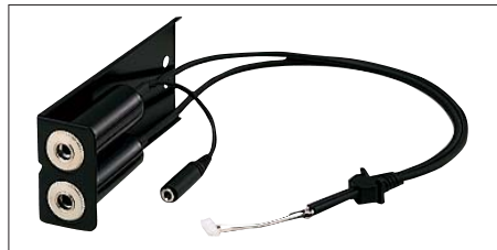
OPC-871 HEADSET ADAPTER For connection with standard airband headset.