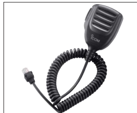
HM-161 HAND MICROPHONE Same as supplied.