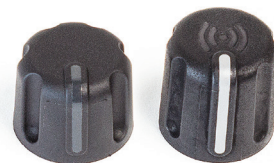
Standard Control Knob RFID Control Knob

◀ Optional colour identification bands for groups with different tasks, coverage areas or shifts