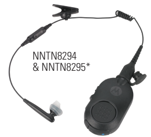
NNTN8294 & NNTN8295*

Bluetooth 2.1 audio is embedded in the radio enabling fast and secure pairing with a variety of Bluetooth accessories. Easy to attach and pair, Motorola Bluetooth accessories enhance performance and security wherever you work. Officers can talk discreetly undercover, move without wires and use their radio like never before.