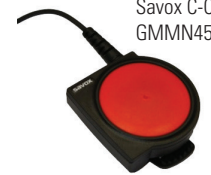
Savox C-C400 GMMN4579A

Complete the solution with the Savox C-C400 com-control unit that enables the use of your two-way radio in hazardous conditions. Designed to be especially robust for the most extreme environments, the extra-large push-to-talk button ensures transmission even when used underneath gear and protective clothing.