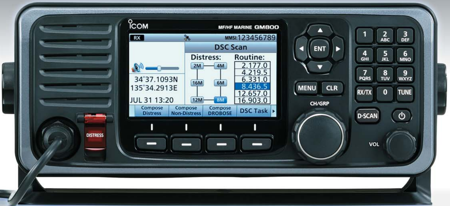
Day mode display (DSC scan screen)