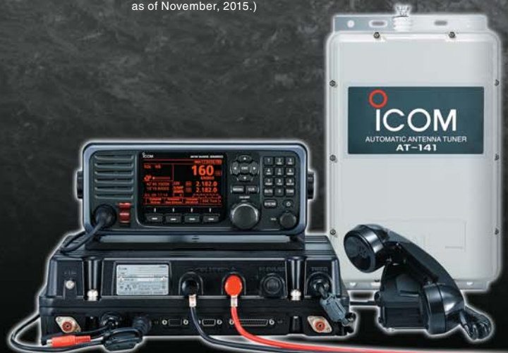
Night mode display

Please Note: The complete GMDSS installation for MF/HF DSC (Class A) and telephony additionally requires the optional antenna tuner, AT-141.